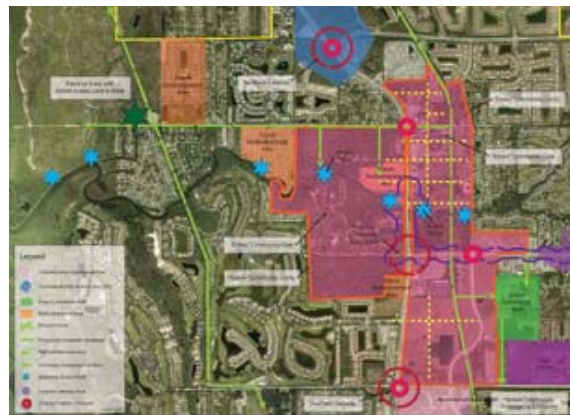
Future guideline for development of the Estero Core Area

DeLisi Fitzgerald is the lead consultant for the update to this plan that encompasses community visioning and changes to the development regulations in order to promote positive growth in the area.